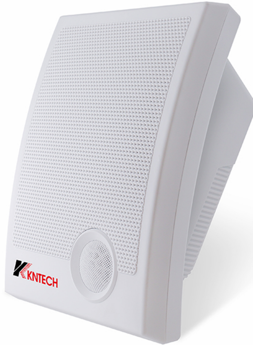
15W speaker Model: L-P-15W10W